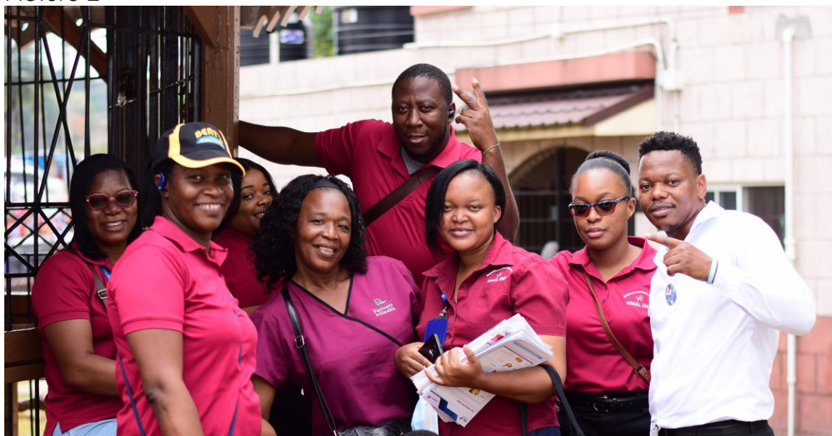
Some of the team members from the Mandeville Regional Hospital renal and anaemia clinics.